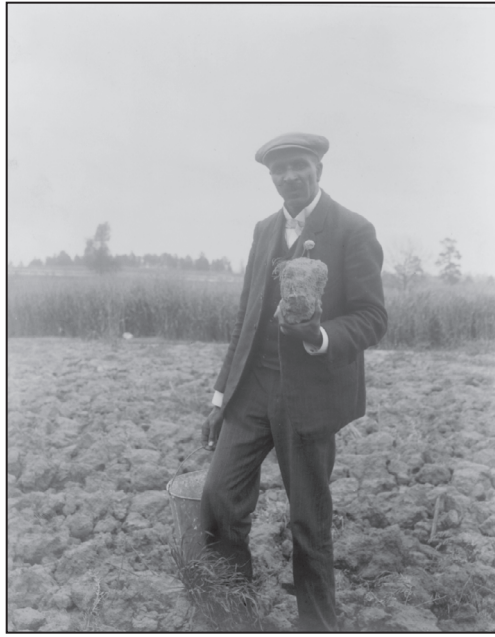
"George Washington Carver, full-length portrait, standing in field, probably at Tuskegee, holding a piece of soil." 1906